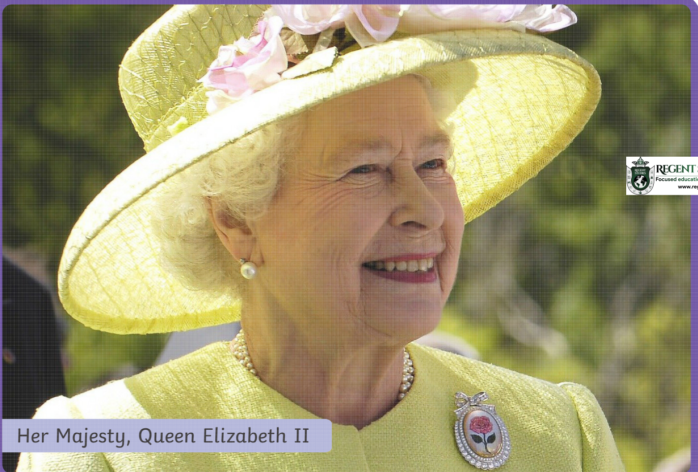
Her Majesty, Queen Elizabeth II