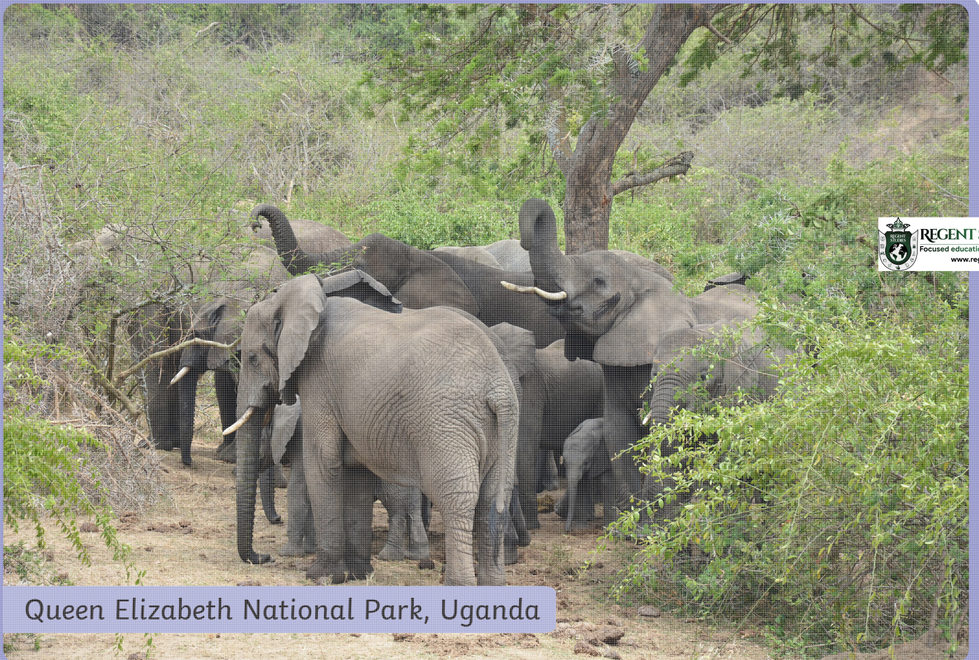
Queen Elizabeth National Park, Uganda