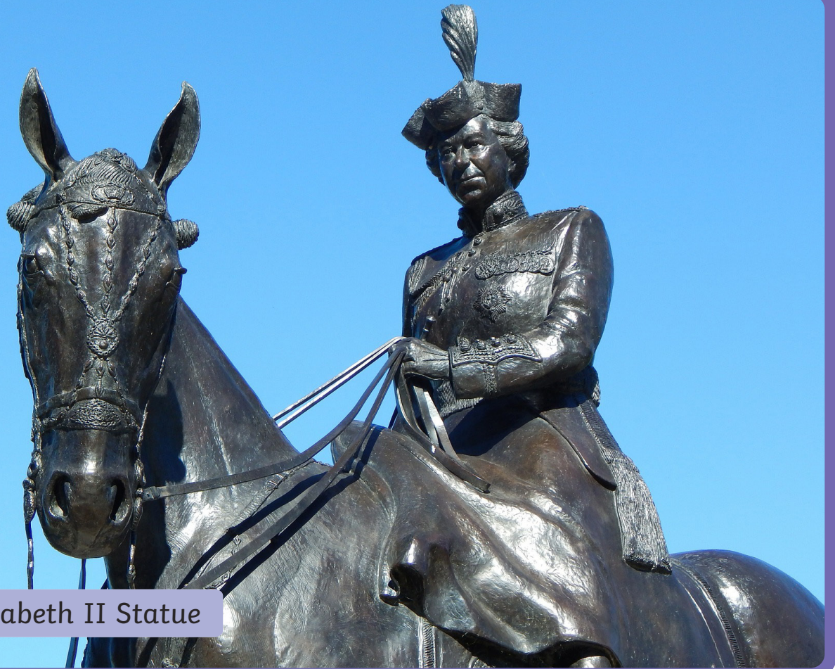
Queen Elizabeth II Statue