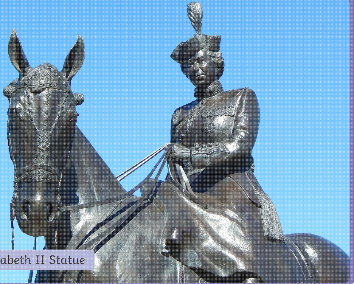
Queen Elizabeth II Statue