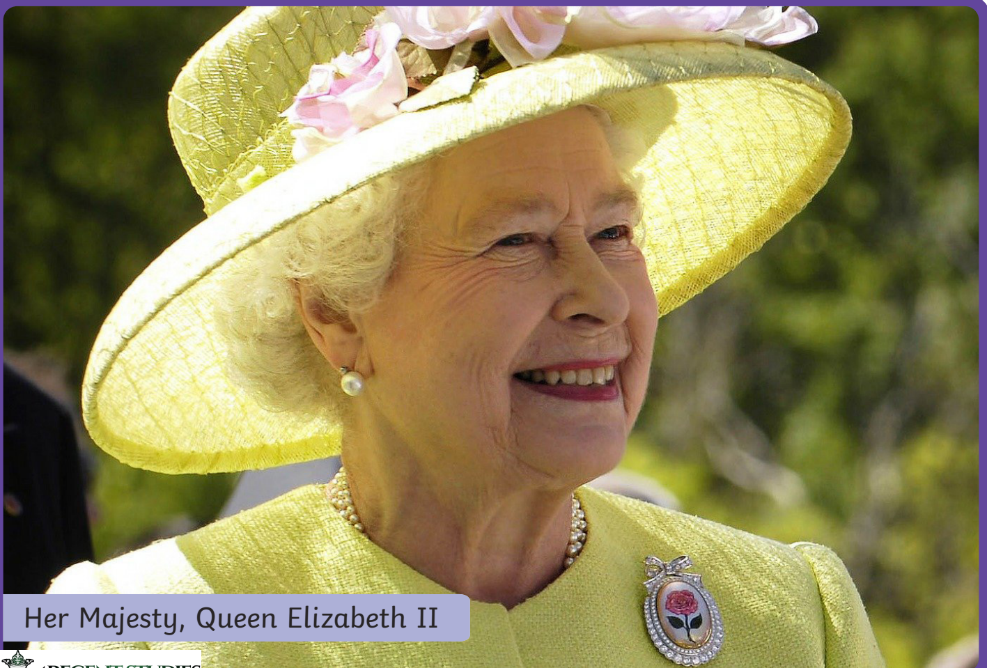
Her Majesty, Queen Elizabeth II