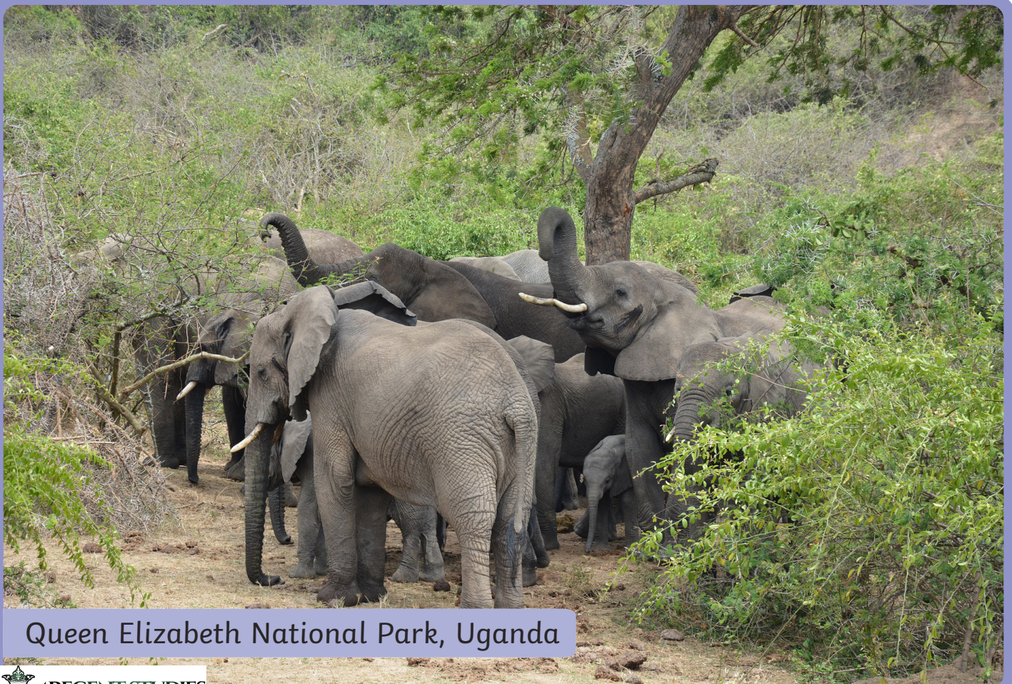
Queen Elizabeth National Park, Uganda